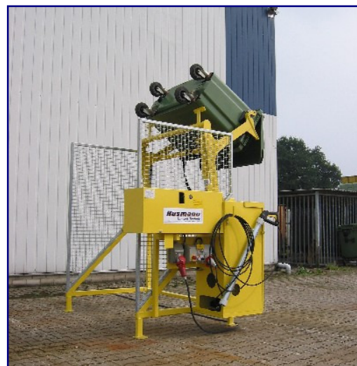
Static tipping device as bin cleaning device

static compactors – portable compactors – compaction containers – transfer stations large volume containers – skips – shredding systems – file shredders – special constructions