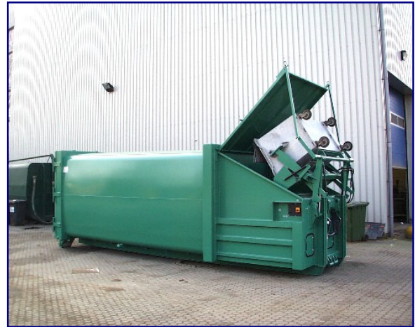
SPB compactor with integral tipping device

Husmann offers individual solutions for various demands. In the following are only few examples of the different designs: