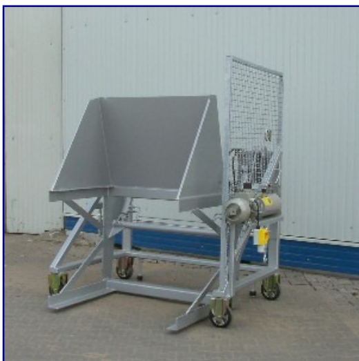
Mobile tipping device for skeleton containers