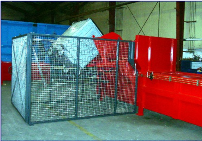
MP compactor with laterally mounted integral tipping device and a safety cage