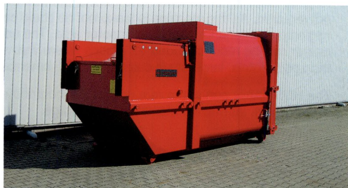
SPB 10 SW-E

Applications: Hospitals, Hotels, Civic Amenity Sites, Markets, Factories, Food Producers and Distribution Centres